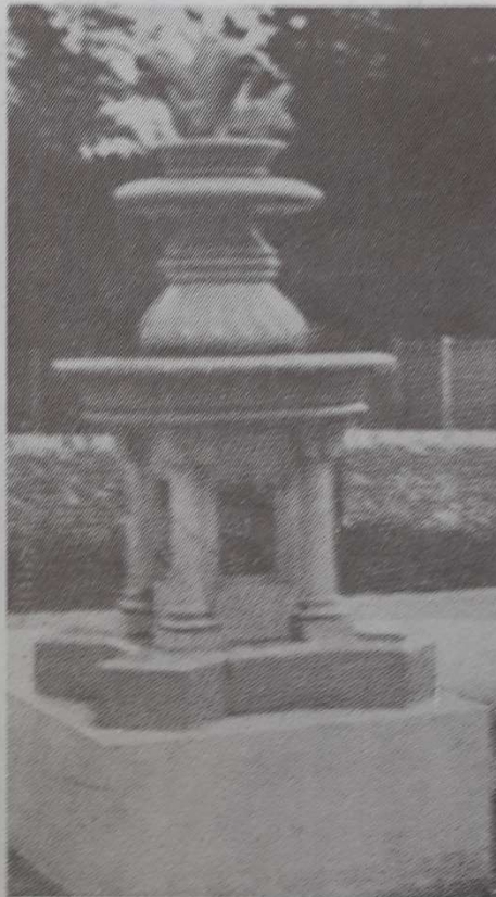
Unveiled by "Miss World" May, 1965