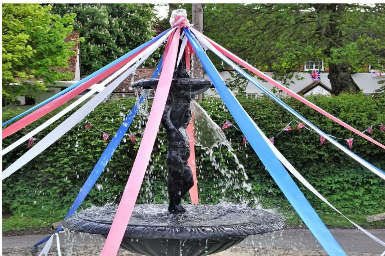
King Charles 111 Coronation June 2023