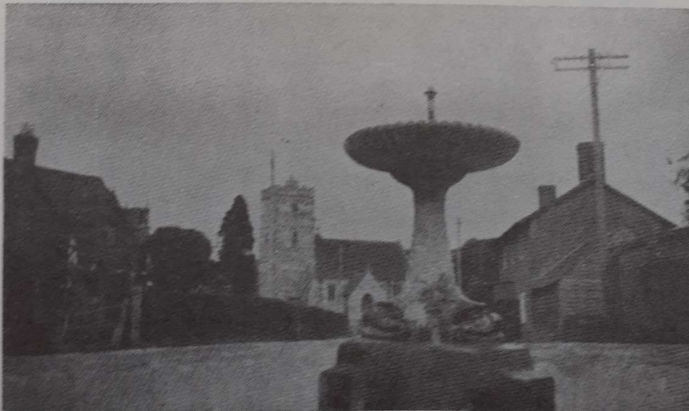
At the Coronation: E.R. 1953