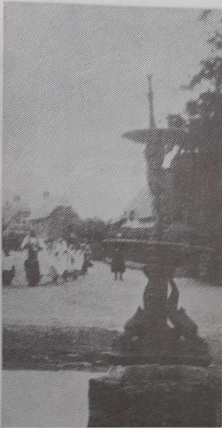
Still "an unique attraction" in 1931

Many reincarnations of the Hinton Martell Fountain over the years.